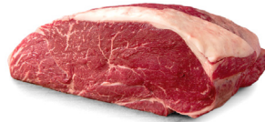
Short Cut Rump Roast (also called Holiday Roast)