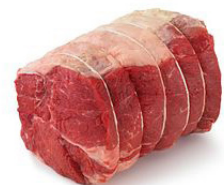
Chuck Roast Boneless