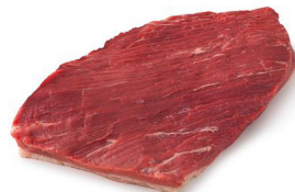
Brisket Single Flat Cut