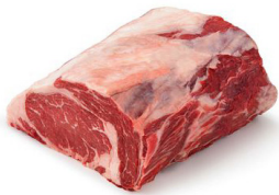
Ribeye Roast Boneless or Bone-In (also called Prime Rib or Delmonico Roast)