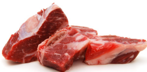
Short Ribs Boneless or Bone-In