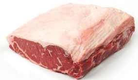
Sirloin Strip Roast (also called Club Roast)